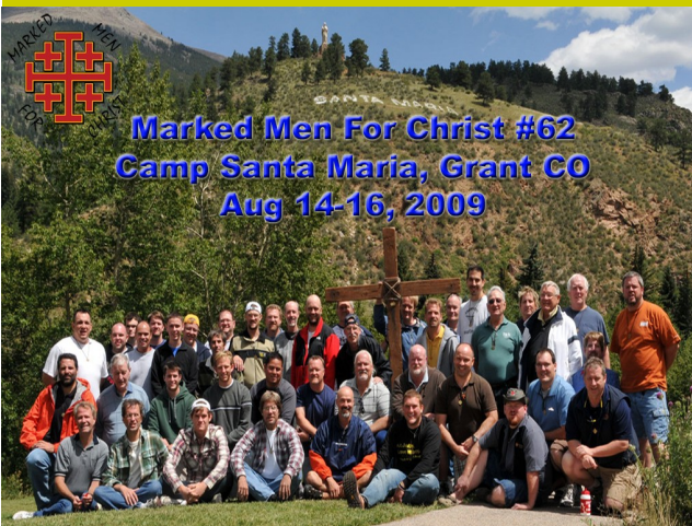
Marked Men For Christ #62 Camp Santa Maria, Grant CO Aug 14-16, 2009